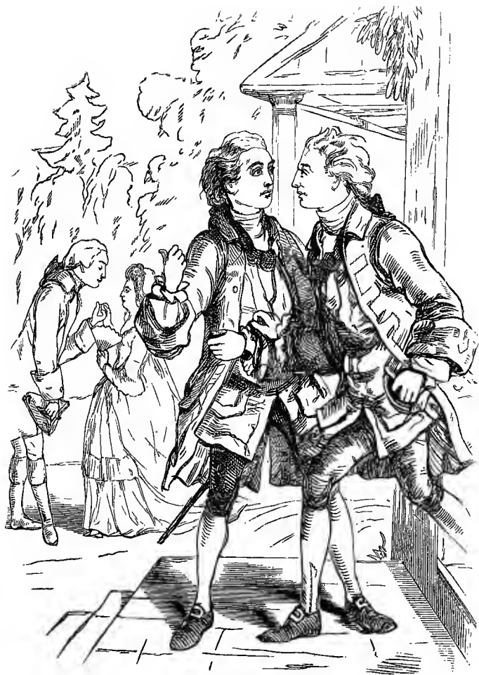
A Stepfather in Prospect.